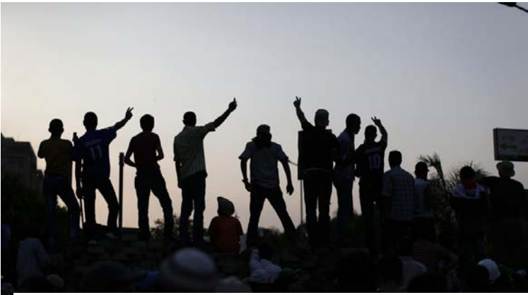
Supporters of ousted President Mohammed Morsi protested at the Republican Guard building in Nasr City, Cairo.