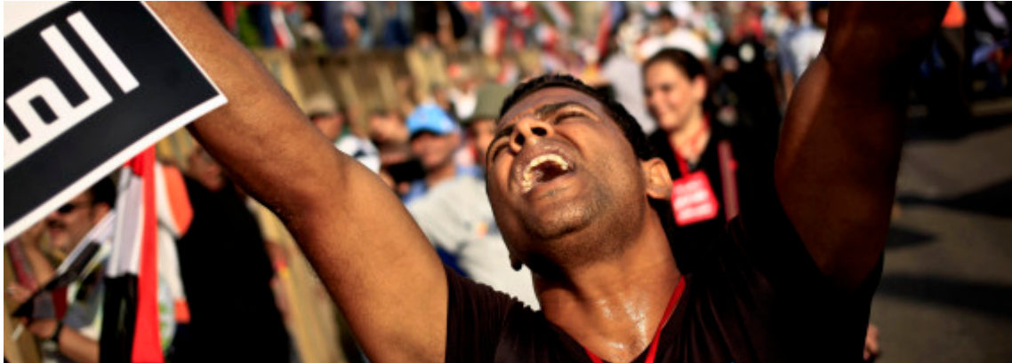
In this Wednesday, July 3, 2013 file photo, an opponent of Egypt's Islamist President Mohammed Morsi chants slogans during a protest outside the presidential palace, in Cairo, Egypt.

http://www.huffingtonpost.com/2013/10/05/arab-spring-democracy_n_4049414.html