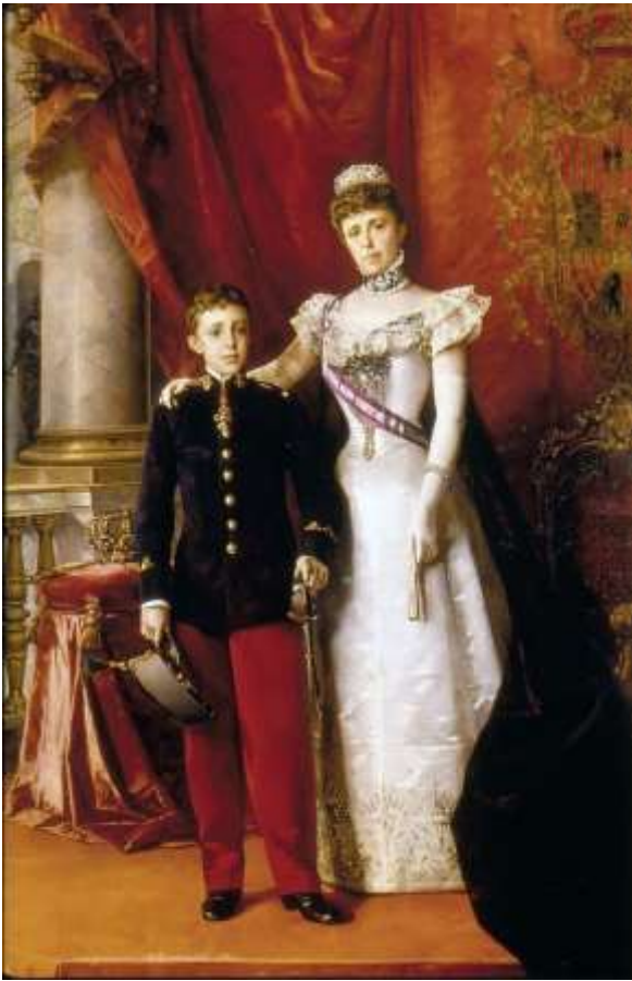
King Alfonso XIII of Spain and his mother, Queen Maria Cristina (1898)