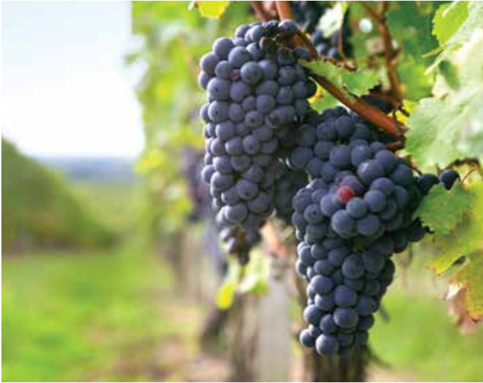
Wine grapes in Bordeaux vineyard

(B=Breakfast, L=Lunch, R=Reception, D=Dinner)