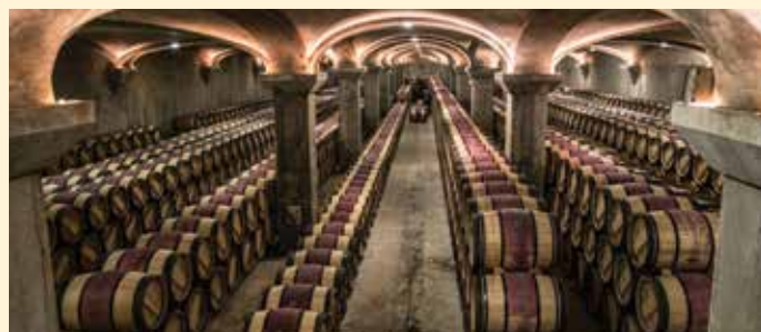
Bordeaux wine cellars

An optional three-day postlude in the Dordogne region is offered, October 26–29.