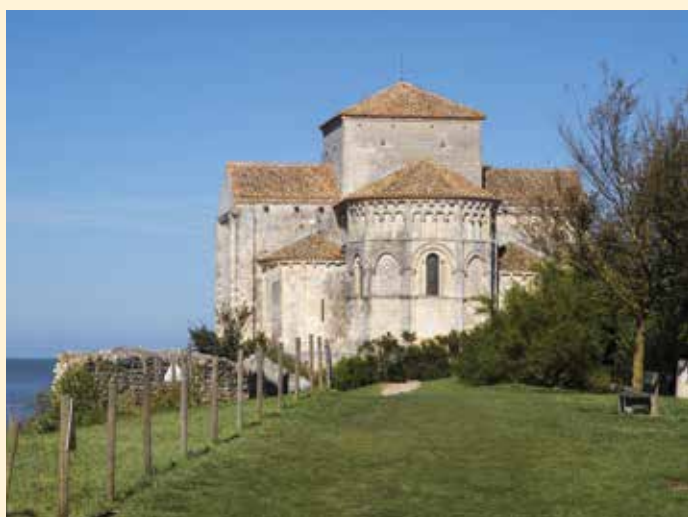
Sainte-Radegonde de Talmont Church on the Gironde estuary

History lovers may admire the splendidly preserved, medieval Château de Roquetaillade—whose original fortifications were built by Charlemagne—or the ruins of Sauve-Majeure Abbey, a masterpiece of Romanesque architecture. Alternatively, oenophiles may choose to visit a private château whose owner will greet us for a sampling of Sauternes, a sweet white wine. B, L, D