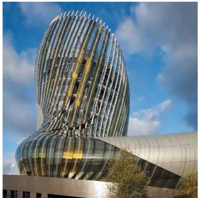
La Cité du Vin

Drive from Libourne to the renowned wine capital of Saint-Émilion, a UNESCO World Heritage Site. Discover the town’s medieval architecture and underground monuments, including the remarkable Monolithic Church, one of the largest underground churches in Europe. B, L, D