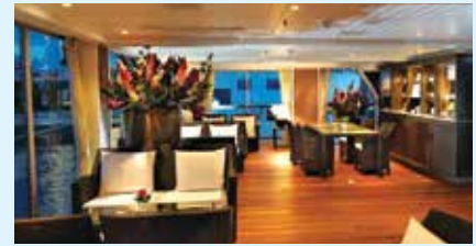
Stateroom on Violin Deck (top); lounge (above)