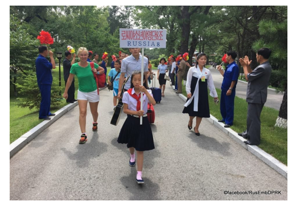
Children from the Russian Far East at North Korea's Songdowown International Children's Camp, July 2017.

Among politically active Russians, the attitudes on North Korea strongly correlate with their ideological convictions. Russian liberals, understandably, have an extremely negative view of North Korea. On the opposite end of the political spectrum, some marginal ultra-left and ultra-right groups demonstrate consistent pro-North positions and perpetuate a eulogic narrative of Pyongyang's actions. The mainstream Communist Party of the Russian Federation (KPRF), which has parliamentary representation, is generally sympathetic to the North. KPRF and its affiliated organizations maintain regular contacts with Pyongyang, including exchanges of delegations. That said, Russian communists cannot but recognize that Juche has strayed very far from the teachings of Marxism-Leninism. Despite its ideological