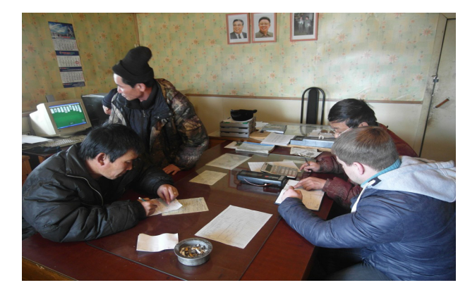
As a side business in this camp, North Korean loggers collect cowberry in the forest and sell it to Russians.

Moscow did not explicitly call for the continuation of the status quo on the Korean peninsula, but its emphasis on the need to seek "peaceful diplomatic solutions" to the North Korean issue in effect meant the conservation of the existing geopolitical realities and preservation of North Korea as a sovereign entity. The prevailing view in the Russian foreign policy community was that North Korean collapse would likely cause radical changes in the Northeast Asian balance of power that might be detrimental to Russia's national interests. The proponents of this view argued that a forced demise of North Korea would essentially mean the revision of the World War II outcomes. Moscow was concerned that an isolated and weakened North Korea would be annexed by U.S.-allied South Korea, expanding the U.S. sphere of influence in Northeast Asia and probably even seeing U.S. troops arriving in North Korea. That was why Moscow needed to maintain good relations with Pyongyang, despite the eccentricity of the Kim dynasty.<sup>11</sup>