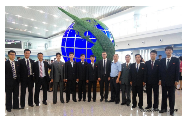
A group of North Korean students at the Pyongyang Airport departing to study in Russia, September 2017.