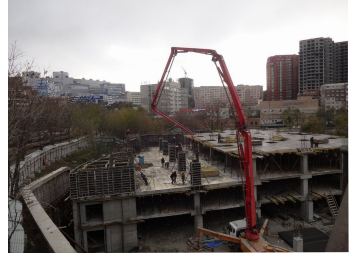
North Koreans working on a construction site in Vladivostok, October 2017.

There is some evidence of illicit trans-border networks formed by Russian, North Korean, and Chinese nationals. According to some reports, the North Korean city of Rajin has become a major hub for the trade of illegally caught wild crab. Russian and foreign poachers bring the illicit seafood catches to Rajin, where it is then shipped to China. In April 2017, at the Bilateral Intergovernmental Consultations on Illegal, Unreported and Unregulated Fishing, Russia formally raised with Pyongyang its concerns over the crab issue.<sup>43</sup> These illicit networks are not limited to the seafood sector. In October 2015, Far Eastern