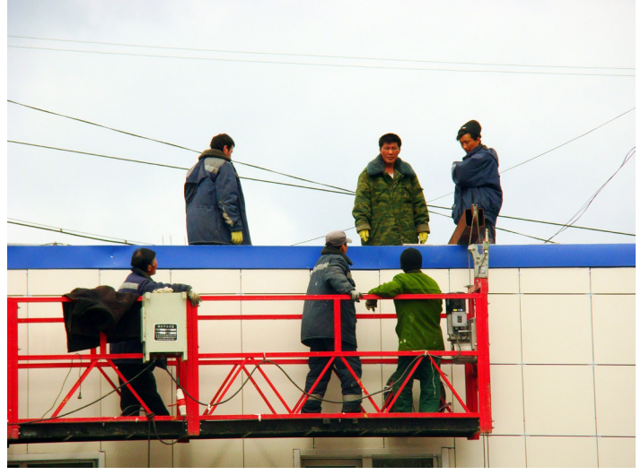
North Koreans working on a construction site in Vladivostok, 2016.

Russian-North Korean economic transactions are mostly pragmatic, driven by market demand and supply. Almost all Russian entities that deal with the