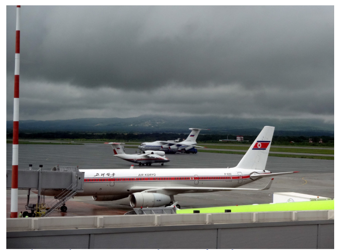
North Korea's Air Koryo Tupolev aircraft at the Vladivostok Airport, 2016.

Russia is the only country other than China on which North Korea relies for access to the global internet. For a number of years, the Russian company SatGate has provided Pyongyang with a backup connection to the world's cyberspace via satellite links.<sup>39</sup> However, most of North Korea's internet traffic still is routed through China. The Chinese monopoly on North Korea's external digital traffic was broken in early October 2017, when a major Russian telecom company, TransTeleCom, began providing an internet connection to the DPRK via its fiber optic lines that run alongside the Khasan-Rajin railway.<sup>40</sup> TransTeleCom is a subsidiary of state-owned Russian Railways. The decision to allow North Korea internet access via Russian networks could not have possibly been made without approval from the Kremlin.