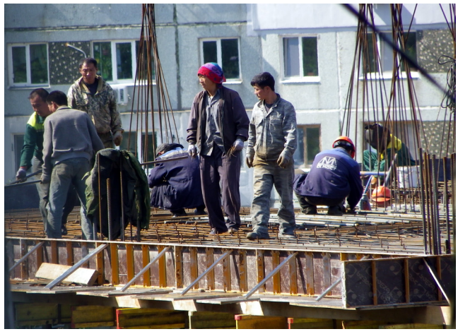
North Koreans working on a construction site in Vladivostok, 2016.

terms, based on world market prices. They possibly include some premium markup for risks involved in dealing with a heavily sanctioned country. This situation is different from China whose crude is delivered to North Korea via a state-owned pipeline, apparently at subsidized prices and on long-term credit, thus essentially constituting energy aid to the DPRK.<sup>11</sup>