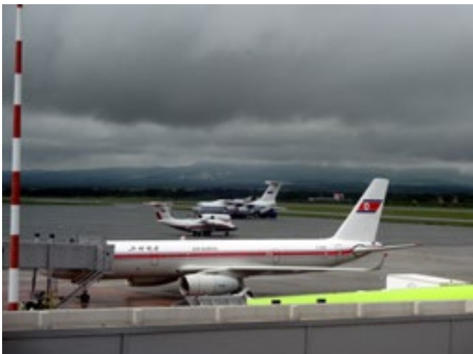
North Korea's Air Koryo Tupolev aircraft at the Vladivostok Airport, 2016.

Russia is the only country other than China on which North Korea relies for access to the global internet. For a number of years, the Russian company SatGate has provided Pyongyang with a backup connection to the world's cyberspace via satellite links. 39 However, most of North Korea's internet traffic still is routed through China. The Chinese monopoly on North Korea's external digital traffic was broken in early October 2017, when a major Russian telecom company, TransTeleCom, began providing an internet connection to the DPRK via its fiber optic lines that run alongside the Khasan-Rajin railway. 40 TransTeleCom is a subsidiary of state-owned Russian Railways. The decision to allow North Korea internet access via Russian networks could not have possibly been made without approval from the Kremlin.