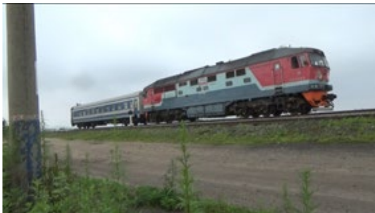
A Russian Railways locomotive headed for North Korea, 2016.

RasonKonTrans, a joint stock company set up by Russian Railways (70% of the shares) and the port of Rajin (30%) to operate the project, was left without South Korean customers. Instead of handling container traffic between South Korea and Europe as originally planned, RasonKonTrans had to switch to trans-shipments of Russian coal bound for China. Currently, coal makes up the bulk of the traffic passing through the Khasan-Rajin rail link, being loaded onto China-bound ships at the RasonKonTrans-owned terminal in the port of Rajin.