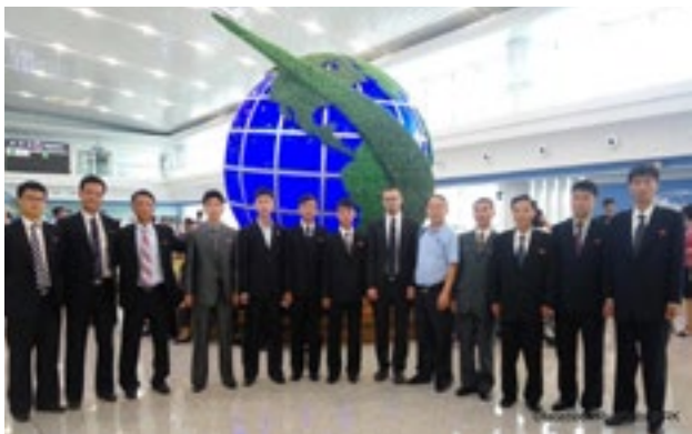
A group of North Korean students at the Pyongyang Airport departing to study in Russia, September 2017.

of North Korea may be shifting. This shift is caused mainly by the surge of anti-Americanism which has been manifest in Russia in recent years, particularly in the wake of the Ukraine crisis. Any country adversarial to Washington, by extension, gets a share of Russian sympathies. Furthermore, the increasing tensions around the Korean peninsula in the spring and summer of 2017 raised a concern in Russian society of a real possibility of war at Russia's doorstep.