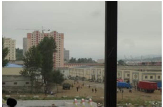
A city market in Rajin, July 2017.

the Soviet times when the majority of North Koreans were hired to work in the timber industry and lived on isolated compounds in remote areas. The stereotype of the North Koreans toiling in Gulag-like labor camps in Siberian wilderness persists in the West and is even reproduced by official reports. 16 In reality, North Korean lumberjacks in Russia, numbering just over 1,000, can now only be found in Amursky Territory ( Amurskaya Oblast' ). The virtual disappearance of North Korean loggers from Russia is due to the general decline of the Russian Far East's timber industry which was hit hard by high export duties introduced by the Russian government in the mid-2000s in order to discourage the exports of unprocessed wood. 17 Furthermore, in the 2000s the manual labor of loggers began to be increasingly replaced by wood harvesting machines.