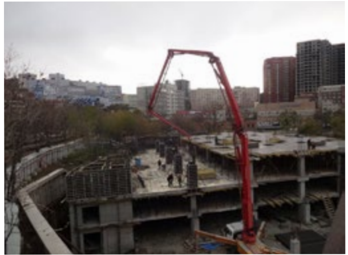
North Koreans working on a construction site in Vladivostok, October 2017.

There is some evidence of illicit trans-border networks formed by Russian, North Korean, and Chinese nationals. According to some reports, the North Korean city of Rajin has become a major hub for the trade of illegally caught wild crab. Russian and foreign poachers bring the illicit seafood catches to Rajin, where it is then shipped to China. In April 2017, at the Bilateral Intergovernmental Consultations on Illegal, Unreported and Unregulated Fishing, Russia formally raised with Pyongyang its concerns over the crab issue. 43 These illicit networks are not limited to the seafood sector. In October 2015, Far Eastern customs officials reported successful interdiction in the Sea of Japan of a large shipment of Russian-originated jade that was headed for North Korea, with China as the final destination. The smugglers operating a vessel bound for the North were two Russian citizens. 44