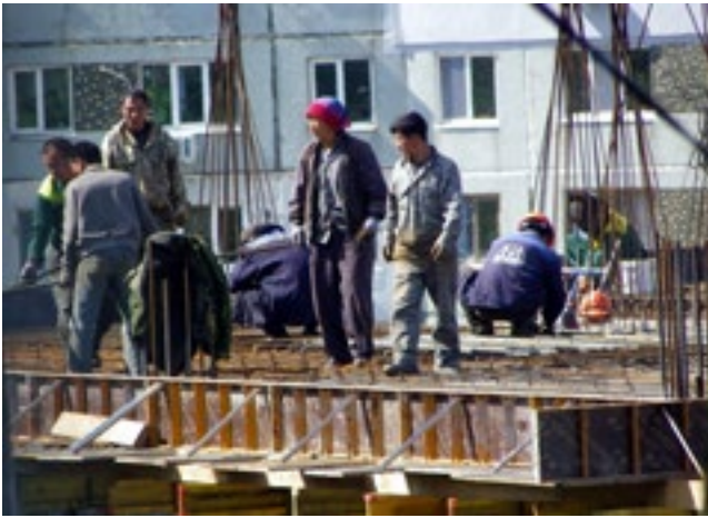
North Koreans working on a construction site in Vladivostok, 2016.

terms, based on world market prices. They possibly include some premium markup for risks involved in dealing with a heavily sanctioned country. This situation is different from China whose crude is delivered to North Korea via a state-owned pipeline, apparently at subsidized prices and on long-term credit, thus essentially constituting energy aid to the DPRK. 11