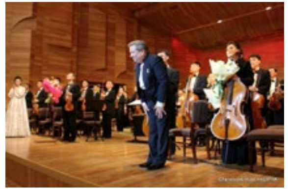
Alexander Petukhov, Russian conductor and professor of the Moscow Conservatory, performs with the DPRK State Symphony Orchestra in Pyongyang, September 2017.

and domestic policy choices, emphasizing the darker aspects of the post-Socialist reality, which, frankly, could have been done without much need to invent and exaggerate. Although anti-Russia propaganda via public media was somewhat restrained, internal party materials carried lots of harsh criticism, showing the fallacy of Russian political course and the disastrous results of the liberal democratic reforms of the early 1990s. Aside from evident didactic domestic purposes, these publications aimed to explain the souring of relations with Russia and show that it was not Pyongyang's fault, but rather the result of Moscow's actions. Russian language studies decreased. Cultural exchanges were restricted to the invitation of pro-communist and "Soviet-style patriotic" artists and performers.