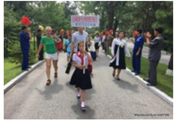
Children from the Russian Far East at North Korea's Songdowon International Children's Camp, July 2017.

Among politically active Russians, the attitudes on North Korea strongly correlate with their ideological convictions. Russian liberals, understandably, have an extremely negative view of North Korea. On the opposite end of the political spectrum, some marginal ultra-left and ultra-right groups demonstrate consistent pro-North positions and perpetuate a eulogic narrative of Pyongyang's actions. The mainstream Communist Party of the Russian Federation (KPRF), which has parliamentary representation, is generally sympathetic to the North. KPRF and its affiliated organizations maintain regular contacts with Pyongyang, including exchanges of delegations. That said, Russian communists cannot but recognize that Juche has strayed very far from the teachings of Marxism-Leninism. Despite its ideological rejection of Communism, the ruling pro-Putin United Russia Party has lately displayed a more or less friendly attitude toward the DPRK, with party activists sometimes even organizing pro-North Korea events. 22