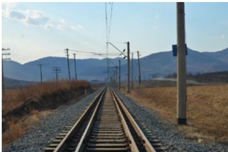
The double-gauge railway connecting Russia and North Korea.

With the exception of China, Russia is the only country that maintains overland transportation communications with the DPRK. Russia and North Korea are connected by a railway bridge across Tumen ( Tumannaya ) River through which cargo and passenger trains travel. In some cases, the bridge can also be used for the passage of cars and trucks. In addition to the existing railway link, in 2015, the two sides decided to build a dedicated automobile link which was planned as a floating (pontoon) bridge across the Tumen. 34 However, this plan has been indefinitely postponed due to the lack of funding and rising strategic uncertainties.