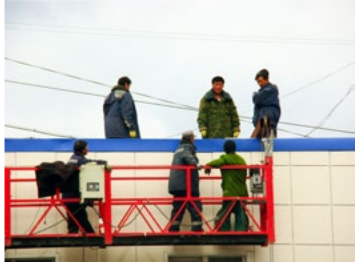
North Koreans working on a construction site in Vladivostok, 2016.

After China, which accounts for the bulk of North Korea's foreign transactions, Russia is at present the second most important economic partner for Pyongyang. However, Russia, unlike China, cannot serve as a major market for North Korea's main commodities because Russia itself is rich in natural resources. Therefore, North Korean merchandise exports to Russia are miniscule. However, there are at least three areas where Russia does make a difference for the DPRK: (1) imports of bituminous coal from Russia, (2) exports of North Korean labor to Russia, and (3) imports from Russia of petroleum products, even though much of the oil trade is disguised by using Chinese and other intermediaries. Russia also remains the only country, apart from China, that provides the DPRK with regular transportation and telecommunications links—via air, rail, sea, and the internet—connecting the isolated nation to the outside world. Should Russia decide to curtail or terminate its economic contacts with the North, Pyongyang will feel real pain.