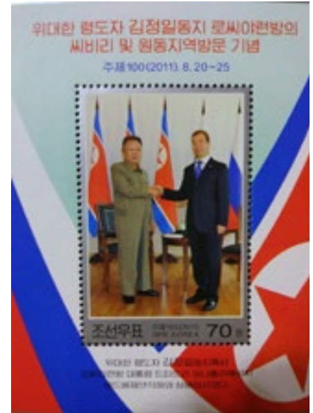
A North Korean stamp commemorating Kim Jong II's trip to Russia in August 2011 and his meeting with President Medvedev.

Notably, Russian foreign policymakers and experts do not see North Koreans as “irrational.” Surely, Pyongyang may at times be an unreliable and seemingly capricious partner, but reason always underlies any change of mood. The rationale is sometimes obfuscated by the lack of information about the inner workings of the North Korean political system, but some logic is almost always in place, and successful cooperation with North Korea requires expertise and knowledge of its inner intricacies. Dismissing Pyongyang’s ability to rationalize its decisions is the first step towards denying North Korea’s international actorship and political agency. Besides, labeling Pyongyang as “irrational” is very often just an excuse for sabotaging dialogue and promoting military agenda, whereas Moscow firmly believes that, in the North Korean case, engagement is preferable to isolation and containment. Additionally, Russia generally views North Korea as a politically stable country. The North Korean political system, despite being leader-centric and perhaps even despotic, is not seen as going to fall apart in the foreseeable future. Consensus among elites and virtual non-existence of any dissent in the society make the North Korean system notably resilient.