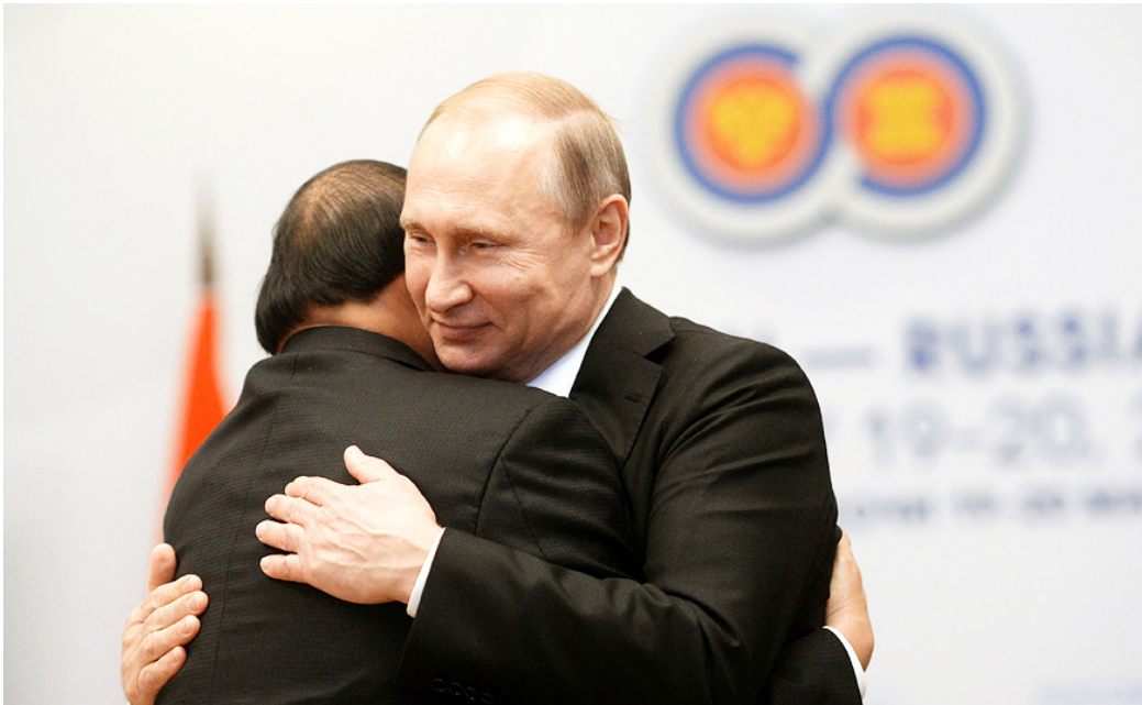
Vladimir Putin and Prime Minister of Vietnam Nguyen Xuan Phuc during a bilateral meeting in Sochi on May 19, 2016.

agreement is pioneering. Since Iran lacks WTO membership, the agreement promotes predictable and clear rules in relation to transparency, non-discrimination, sanitary, and technical regulation, and it resolves disputes via binding arbitration. 33 The agreement as it stands will only last for a three-year period as a test case for developing further relations. The agreement will either be extended as is or followed by greater liberalization. Thus, from Russia's perspective, a deal with Iran is not only conducive to trade, but also offers a strategic advantage over competing powers. For external actors like the EU, however, this deal only confirms their view of Russia's poor record with WTO rules 34 and feeds skepticism about the EAEU's problematic institutional foundations. 35