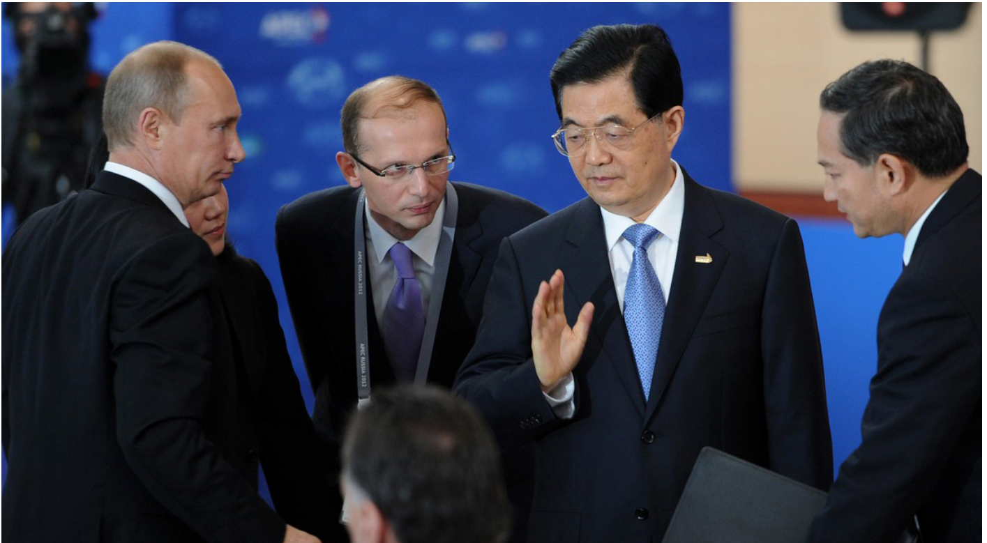
EAEU Summit, May 2018.

disregarded in negotiations. In addition to the formal requirement for consensus in EAEU matters, Russia has an interest in delivering on regional integration and maintaining an internal balance of interests. While Russia proved able to use force in Ukraine, its main mode of operation within the EAEU is not one of overt coercion. What determines the acquiescence of its EAEU partners is their interest in procuring certain benefits, such as cheap energy or enhanced security, in exchange for their loyalty. 17 The need to keep this internal balance of interests, however, limits the extent of liberalization in trade agreements concluded by the EAEU.