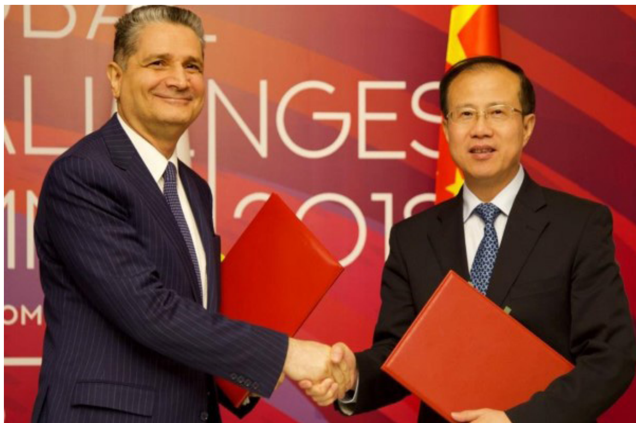
Signing of the Agreement on Trade and Economic Cooperation between the EAEU and the PRC.