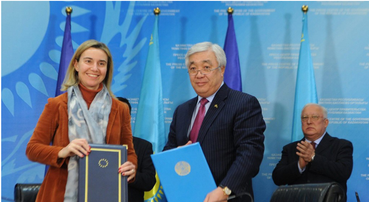
European Union High Representative Federica Mogherini (L) and Kazakh FM Erlan Idrissov (R) May 2015.

in its standoff with the West. 59 Thus, even apart from the difficulties in resolving the Ukraine crisis, there are misgivings about the nature of the Eurasian bloc and the extent to which a non-preferential agreement with the EAEU may legitimize Russia's political ends.