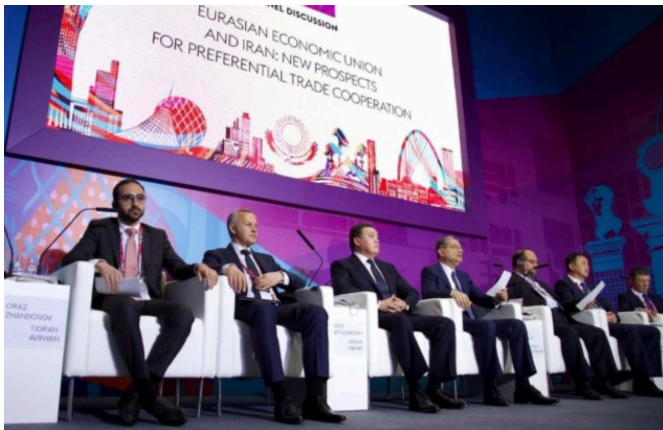
Discussions between the EAEU and Iran, May 2018.