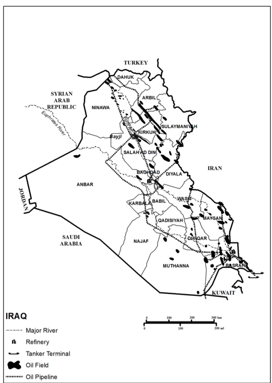
Figure 2: Oil Map of Iraq