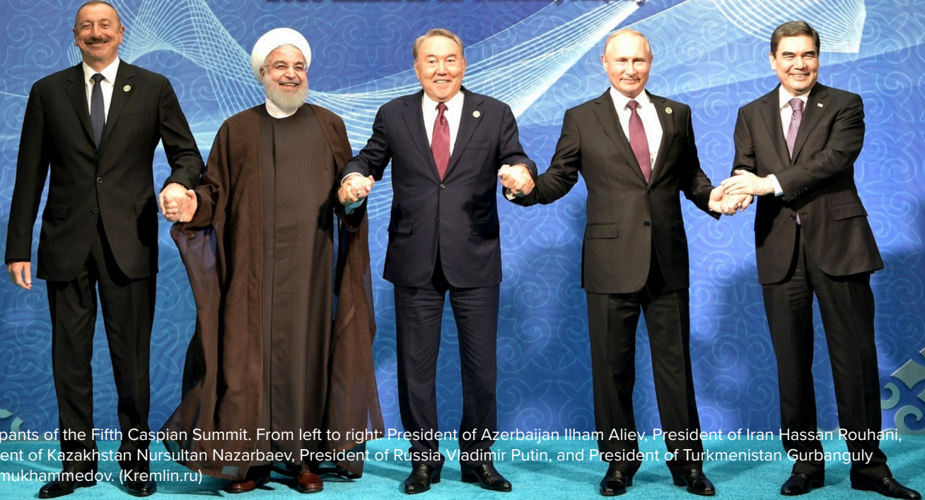
Participants of the Fifth Caspian Summit. From left to right: President of Azerbaijan Ilham Aliyev, President of Iran Hassan Rouhani, President of Kazakhstan Nursultan Nazarbaev, President of Russia Vladimir Putin, and President of Turkmenistan Gurbanguly Berdimukhammedov.

sanctions. 30 In addition to NSTC, Iran's interim trade agreement with the Eurasian Economic Union (EAEU) has factored into Russia's wider strategy to use Iran as a transit hub for its non-hydrocarbon exports. 31 One of the results of the preferential trade agreement was the February 2019 trilateral memorandum of understanding on wheat, under which Russia and Kazakhstan can import wheat to Iran for processing and export to