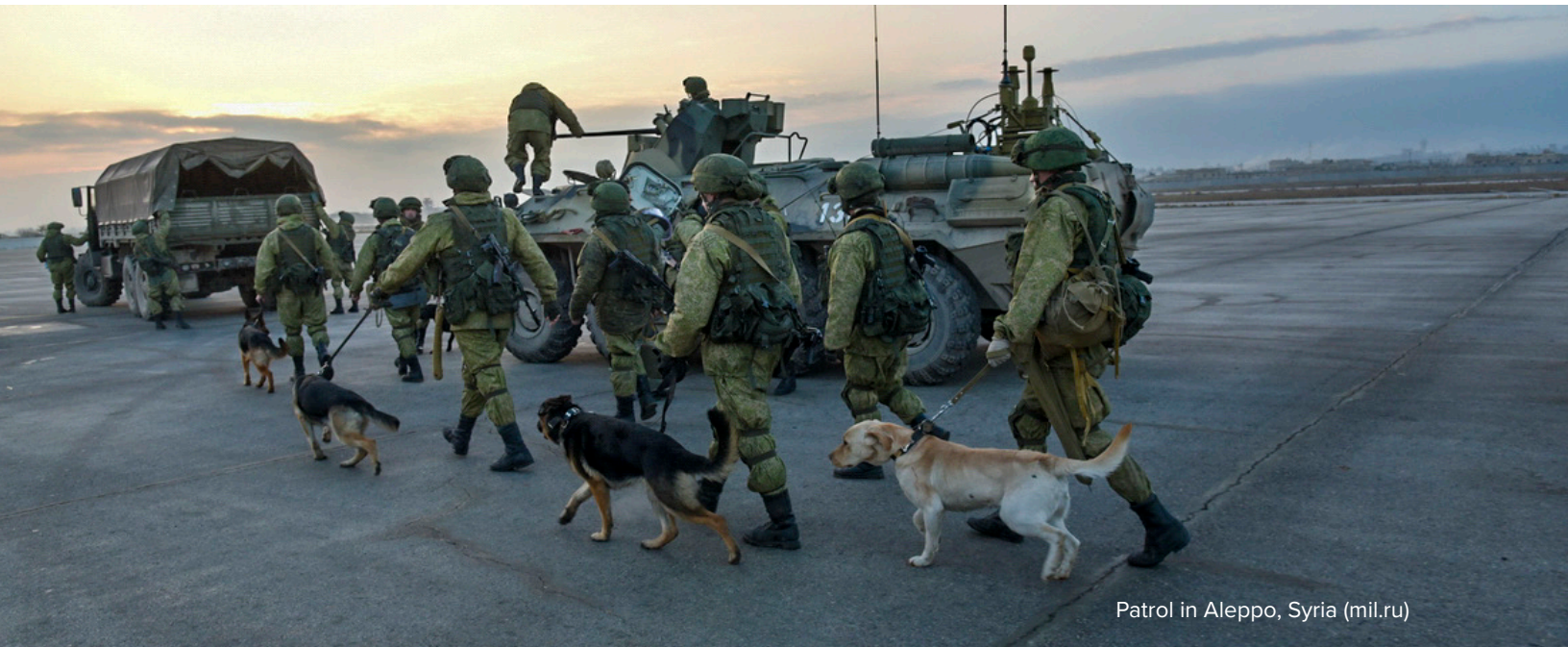
Patrol in Aleppo, Syria

Russia-Iran relations have been driven by overlapping and diverging interests, which have manifested in compartmentalized areas of cooperation ranging from the Syrian Civil War to contesting U.S. unilateral sanctions policy. The tendency to emphasize the tensions in Russia-Iran relations obscures the extent to which Russia and Iran have strengthened ties, overcoming historical mistrust and traditional geopolitical tensions. Russia's balancing act in the Middle East will seek to ensure that its relationship with Iran does not antagonize Tehran's chief geopolitical rivals, such as Israel, UAE, and Saudi Arabia. Although Moscow covets the diplomatic gains and prestige accrued from its role as a constructive regional arbitrator, Russia holds a vested interest in preventing any military action or externally imposed regime change against Iran. In Syria, Russia and Iran will be forced to integrate their plans for military reform under an umbrella structure based on regional and functional divisions.