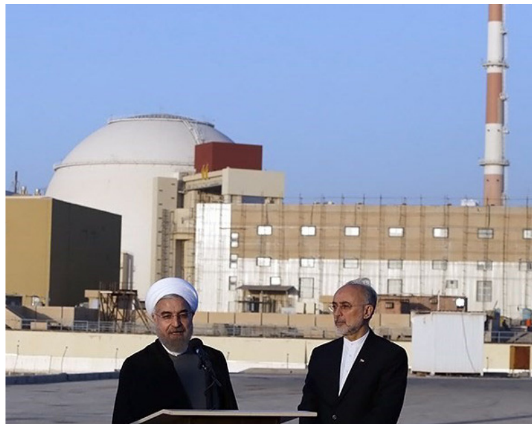
Iranian President Hassan Rouhani and Head of the Atomic Energy Organization of Iran (AEOI) Ali Akbar Salehi in Bushehr Nuclear Plant.

In the 1990s, Russia viewed the construction of the Bushehr Nuclear Power Plant with Iran as a means of reviving its nuclear industry. Numerous financial and technical setbacks on the completion of Bushehr complicated relations because Iran considered the delays political. In reality, the majority of the delays at Bushehr was due to complexity in integrating Russian-made technology with old German equipment that remained after Siemens abandoned the project during the Iran-Iraq War. For Russia, the completion of Bushehr was necessary for maintaining its business reputation in the broader civilian nuclear sector and for demonstrating that Russians could complete a technologically complex project. 19 Though Russia has defended Iran's right to the peaceful use of nuclear energy, Moscow considered the 2002 revelations of Iran's covert nuclear program, including uranium enrichment facilities in Natanz and weapon-grade plutonium production facilities in Arak, as a breach of trust. To protect business interests and to quell U.S. concerns, Russia reached an agreement with Iran to return spent fuel from Bushehr to Russia, which prevented the conversion of spent fuel into nuclear-grade plutonium. 20 Likewise, Russia lobbied for the exemption of civilian nuclear energy and existing cooperation in light-