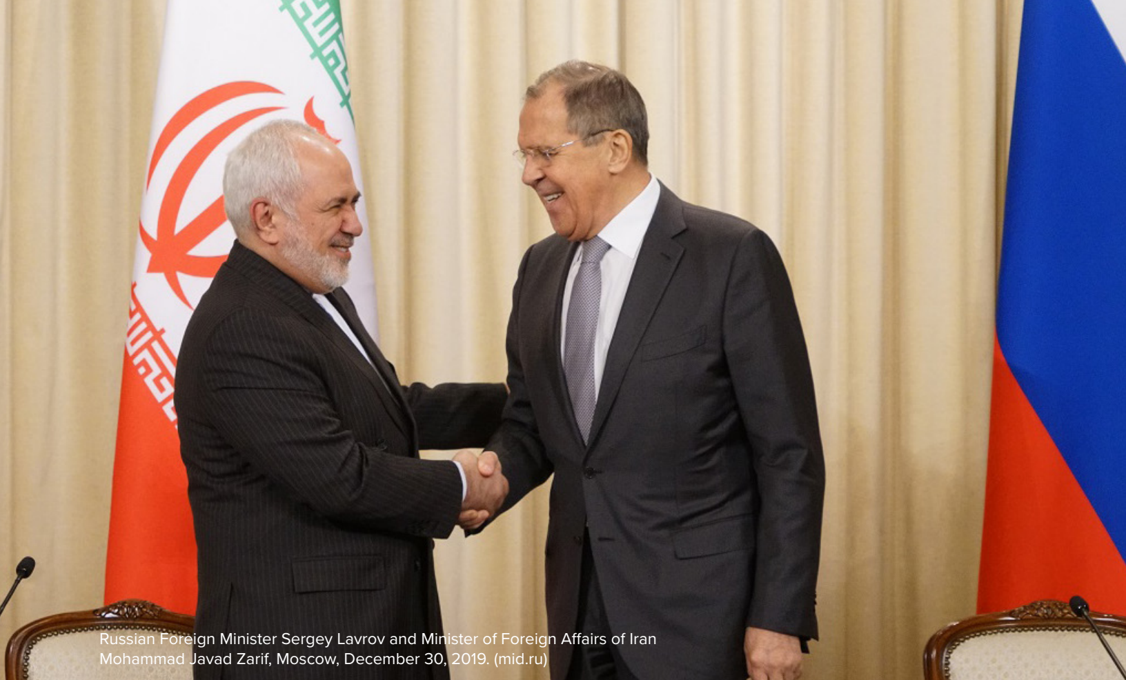
Russian Foreign Minister Sergey Lavrov and Minister of Foreign Affairs of Iran Mohammad Javad Zarif, Moscow, December 30, 2019.

an “indication of the two sides’ growing and strategic ties.” 37 Russia’s support for Iran has shifted Iranian domestic and elite discourse, a stark contrast to Tehran’s criticism of Russian acquiescence to punitive measures under UN sanctions that negatively affected relations. Lacking China’s largesse to help Iran weather the impact of U.S. sanctions, Russia has increased its diplomatic efforts to salvage the JCPOA. With Iran’s phased reduction of its JCPOA obligations, Russia continues to denounce “the illegitimate unilateral sanctions and the wider US-led anti-Iran campaign” while pressuring Tehran to return to the JCPOA enrichment limits and to remain in the Nuclear Non-Proliferation Treaty. 38