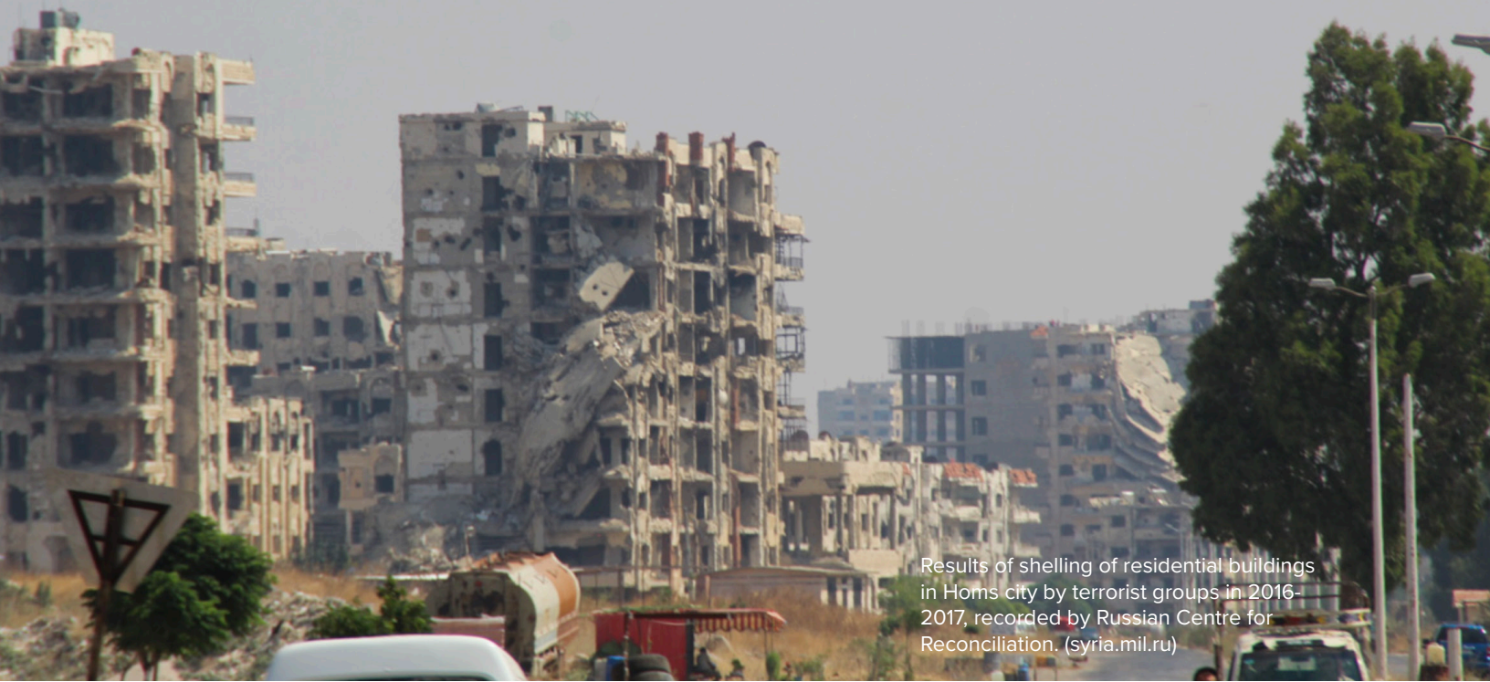
Results of shelling of residential buildings in Homs city by terrorist groups in 2016-2017, recorded by Russian Centre for Reconciliation.