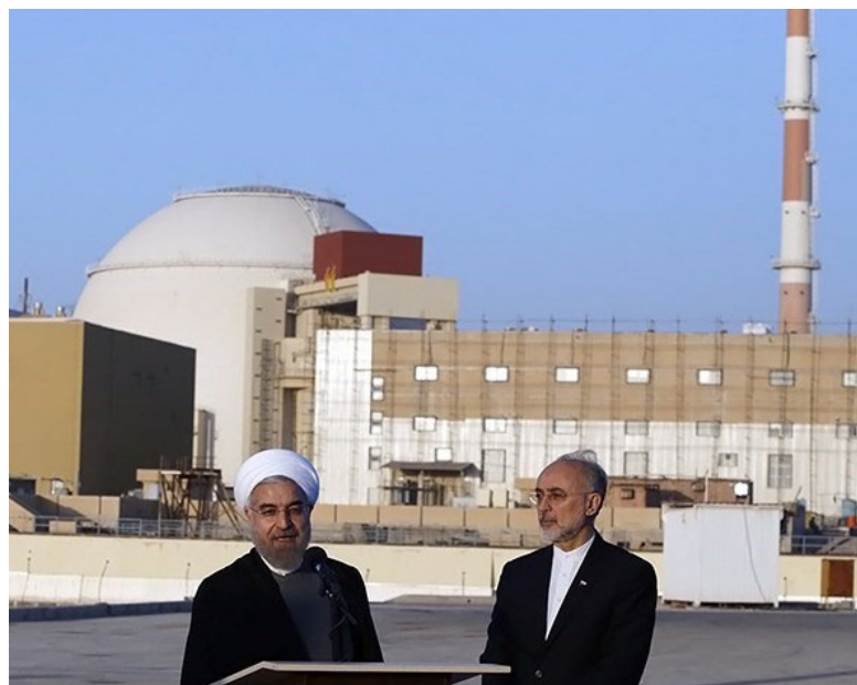
Iranian President Hassan Rouhani and Head of the Atomic Energy Organization of Iran (AEOI) Ali Akbar Salehi in Bushehr Nuclear Plant.

In the 1990s, Russia viewed the construction of the Bushehr Nuclear Power Plant with Iran as a means of reviving its nuclear industry. Numerous financial and technical setbacks on the completion of Bushehr complicated relations because Iran considered the delays political. In reality, the majority of the delays at Bushehr was due to complexity in integrating Russian-made technology with old German equipment that remained after Siemens abandoned the project during the Iran-Iraq War. For Russia, the completion of Bushehr was necessary for maintaining its business reputation in the broader civilian nuclear sector and for demonstrating that Russians could complete a technologically complex project. 19 Though Russia has defended Iran's right to the peaceful use of nuclear energy, Moscow considered the 2002 revelations of Iran's covert nuclear program, including uranium enrichment facilities in Natanz and weapon-grade plutonium production facilities in Arak, as a breach of trust. To protect business interests and to quell U.S. concerns, Russia reached an agreement with Iran to return spent fuel from Bushehr to Russia, which prevented the conversion of spent fuel into nuclear-grade plutonium. 20 Likewise, Russia lobbied for the exemption of civilian nuclear energy and existing cooperation in light-