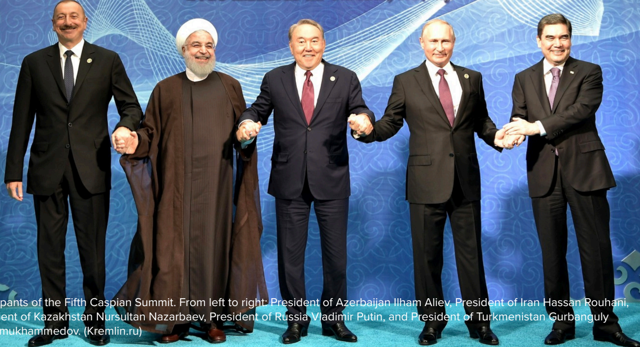
Participants of the Fifth Caspian Summit. From left to right: President of Azerbaijan Ilham Aliyev, President of Iran Hassan Rouhani, President of Kazakhstan Nursultan Nazarbaev, President of Russia Vladimir Putin, and President of Turkmenistan Gurbanguly Berdimukhammedov.

sanctions. 30 In addition to NSTC, Iran's interim trade agreement with the Eurasian Economic Union (EAEU) has factored into Russia's wider strategy to use Iran as a transit hub for its non-hydrocarbon exports. 31 One of the results of the preferential trade agreement was the February 2019 trilateral memorandum of understanding on wheat, under which Russia and Kazakhstan can import wheat to Iran for processing and export to