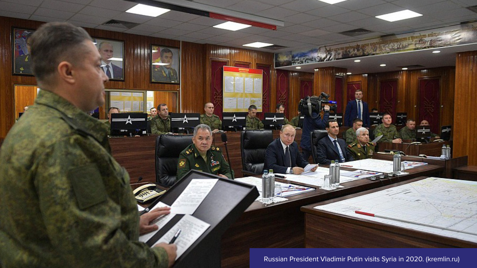
Russian President Vladimir Putin visits Syria in 2020.

More fundamentally, Moscow's operations in Syria highlighted how little the Russian approach to counterterrorism changed over the years, despite improvements in technology. Chief to this approach in Syria was the belief that anyone who is armed and opposes Assad is a terrorist—a view that Assad himself also holds. This view was also an extension of the Kremlin's historic definition of terrorism and approach to it, as outlined earlier. Indeed, Moscow's airstrikes aimed to give the West a choice: ISIS or Assad, chaos or stability.