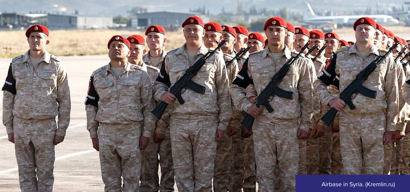
Airbase in Syria.

its own terrorist problem. 6 Indeed, Moscow's heavy-handed approach in Chechnya in the 1990s, coupled with its focus on pushing out or ignoring moderate and secular leaders in favor of those who professed loyalty, only fueled radicalization and helped turn what began as a secular separatist struggle in Chechnya into a more extremist one, with a radical Islamist component. 7