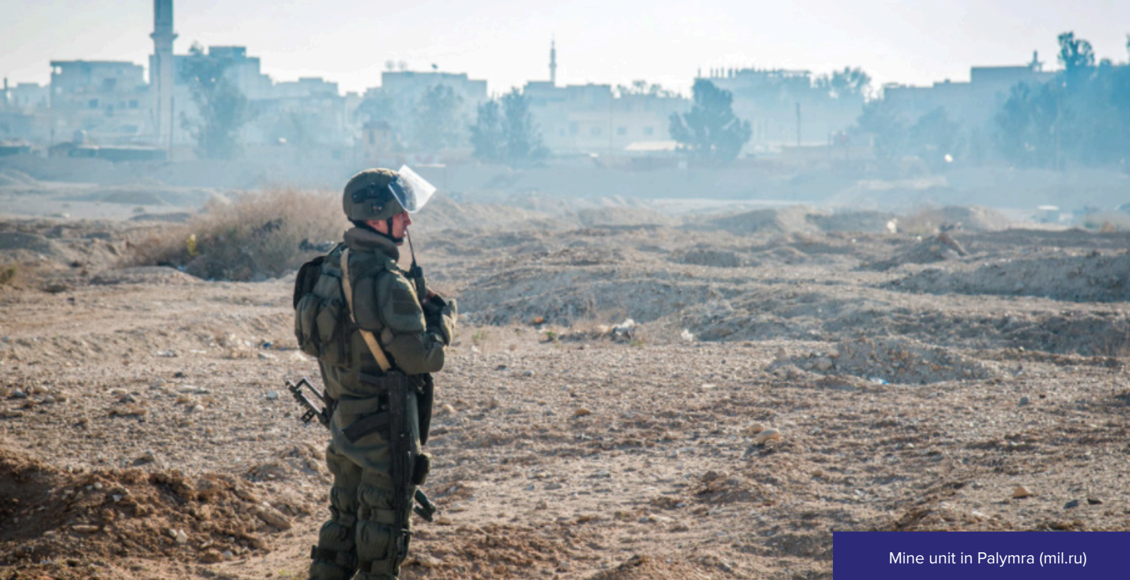
Mine unit in Palmyra

Cargo allegedly managed to verify at least 649 Russian soldiers (excluding PMCs) killed in action in Ukraine between 2014-2016, 20 but the real numbers are likely higher.