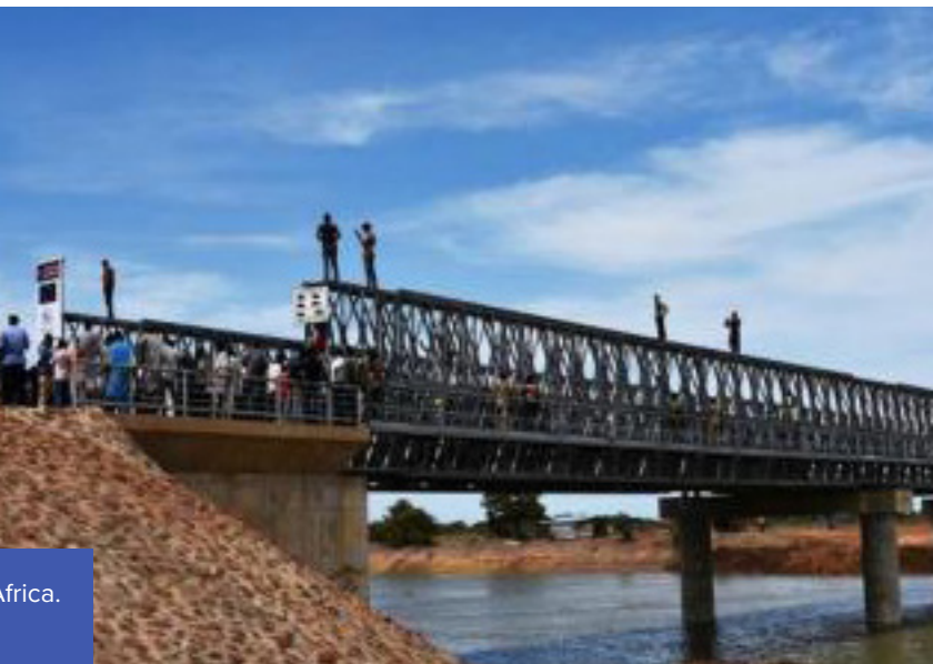
Water system and bridge funded by the EU Emergency Trust Fund for Africa. (ec.europa.eu)