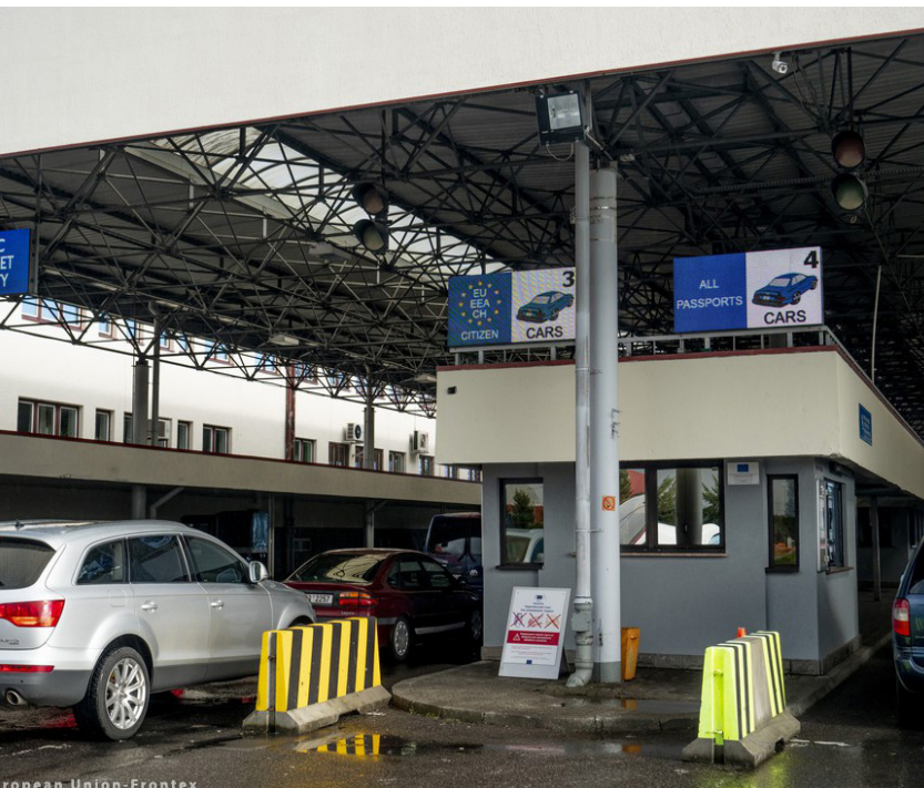
Cars passing through a border control in Schengen.