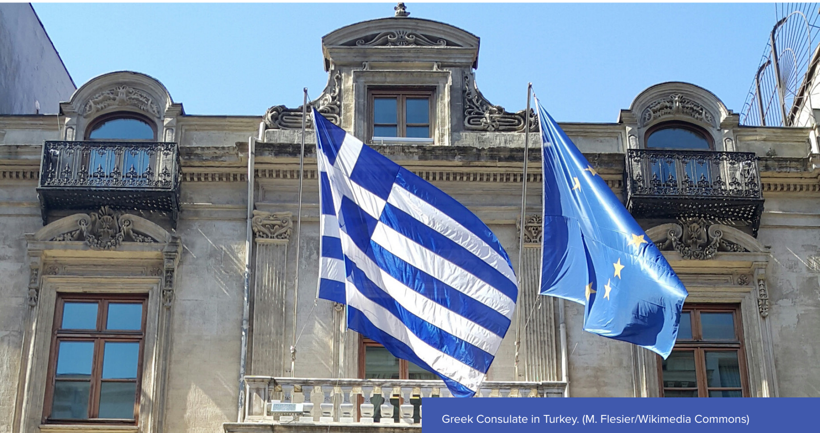
Greek Consulate in Turkey.

policies. But the EU had no real intention of allowing Turkey to join, eventually poisoning relations and precluding alternative forms of partnership.