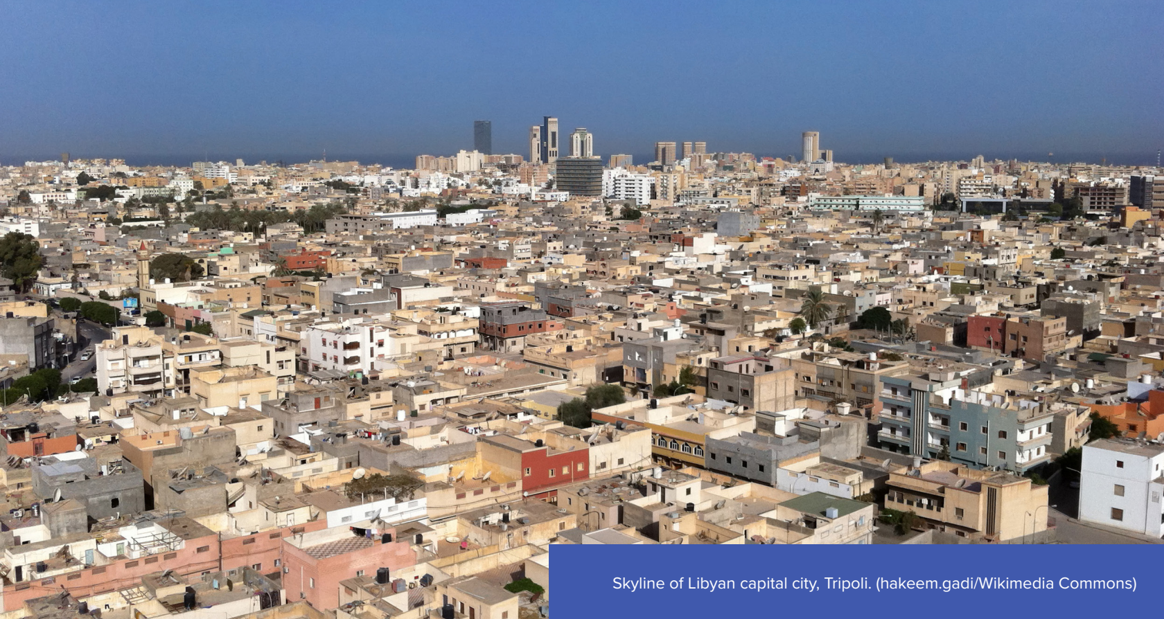
Skyline of Libyan capital city, Tripoli.

More recently, it has pressed Morocco to reinforce its southern border, which it perceived as a second route for Africans to the EU. The effect of all this has been to undermine efforts in West Africa to create a regional labor market particularly on the part of Morocco, which saw immigration from Cote D'Ivoire and Nigeria as a way to build bridges to those countries. 13