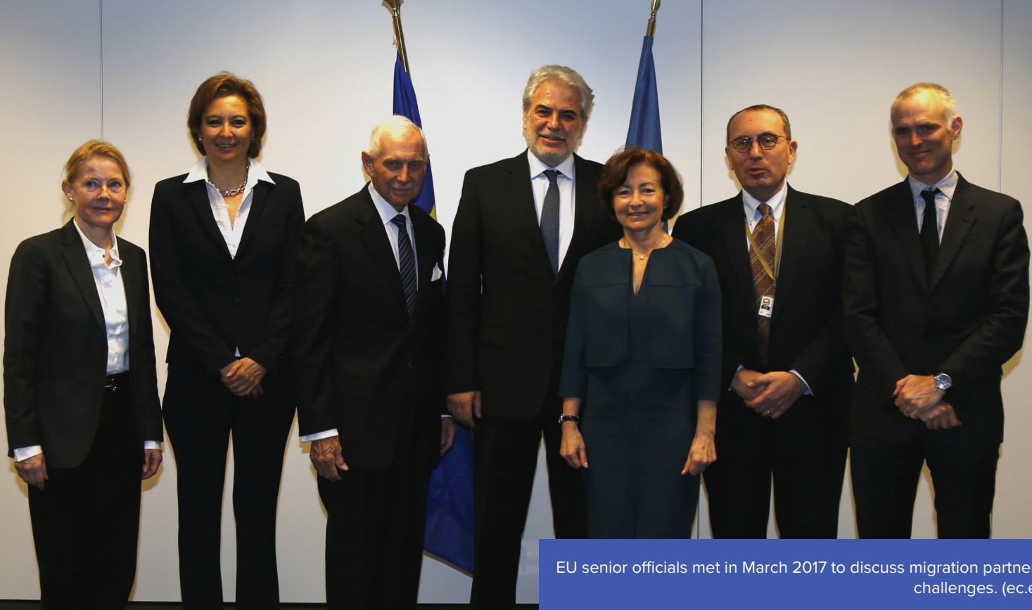
EU senior officials met in March 2017 to discuss migration partnerships and challenges. (ec.europa.eu)