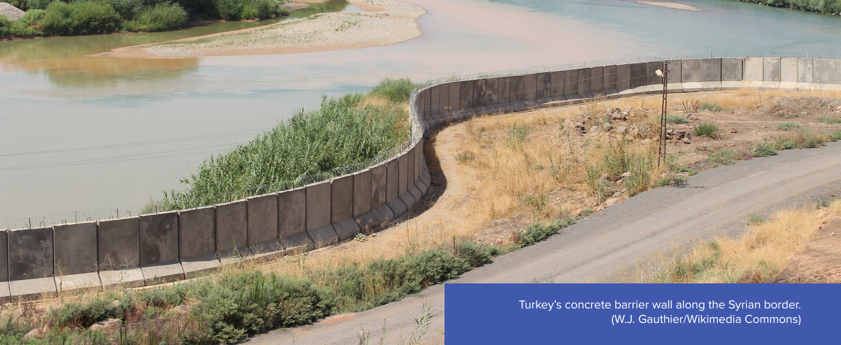
Turkey's concrete barrier wall along the Syrian border.