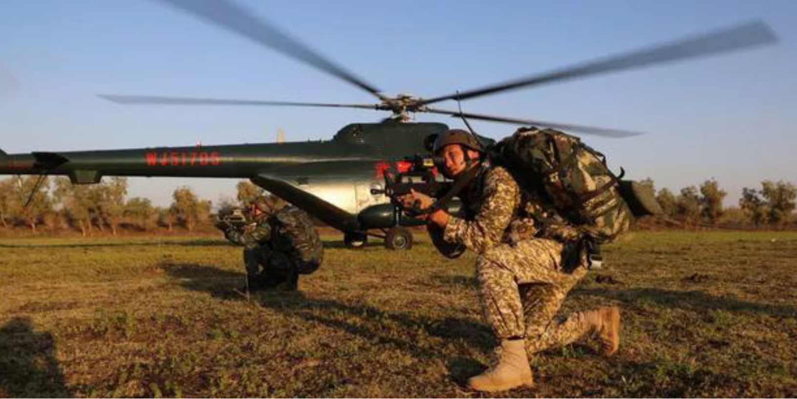
Chinese and Kazakh troops in a 2019 joint exercise in Eastern Kazakhstan.

went abroad to conduct a military exercise. 74 At the time, the PRC considered Kyrgyzstan to have a serious terrorism problem due to its porous mountainous border with Tajikistan (and by extension Afghanistan), which allows for easy illegal entry. The PRC was particularly concerned about the presence of Xinjiang independence supporters who were trained in Afghanistan and the prospects of them making their way into Xinjiang via Kyrgyzstan. This 2002 exercise was conducted between Chinese-Kyrgyz border guards in a mountainous border area near a Chinese-Kyrgyz checkpoint to jointly combat the crossing of a terrorist group from Kyrgyzstan to Xinjiang. 75