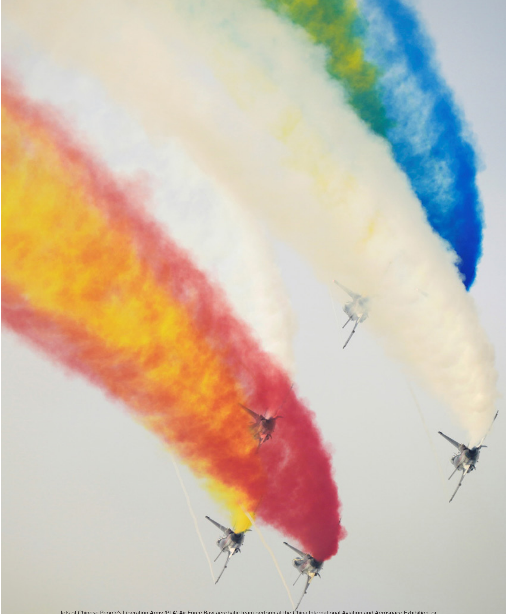
Jets of Chinese People's Liberation Army (PLA) Air Force Bayi aerobatic team perform at the China International Aviation and Aerospace Exhibition, or Airshow China, in Zhuhai, Guangdong province, China September 28, 2021.