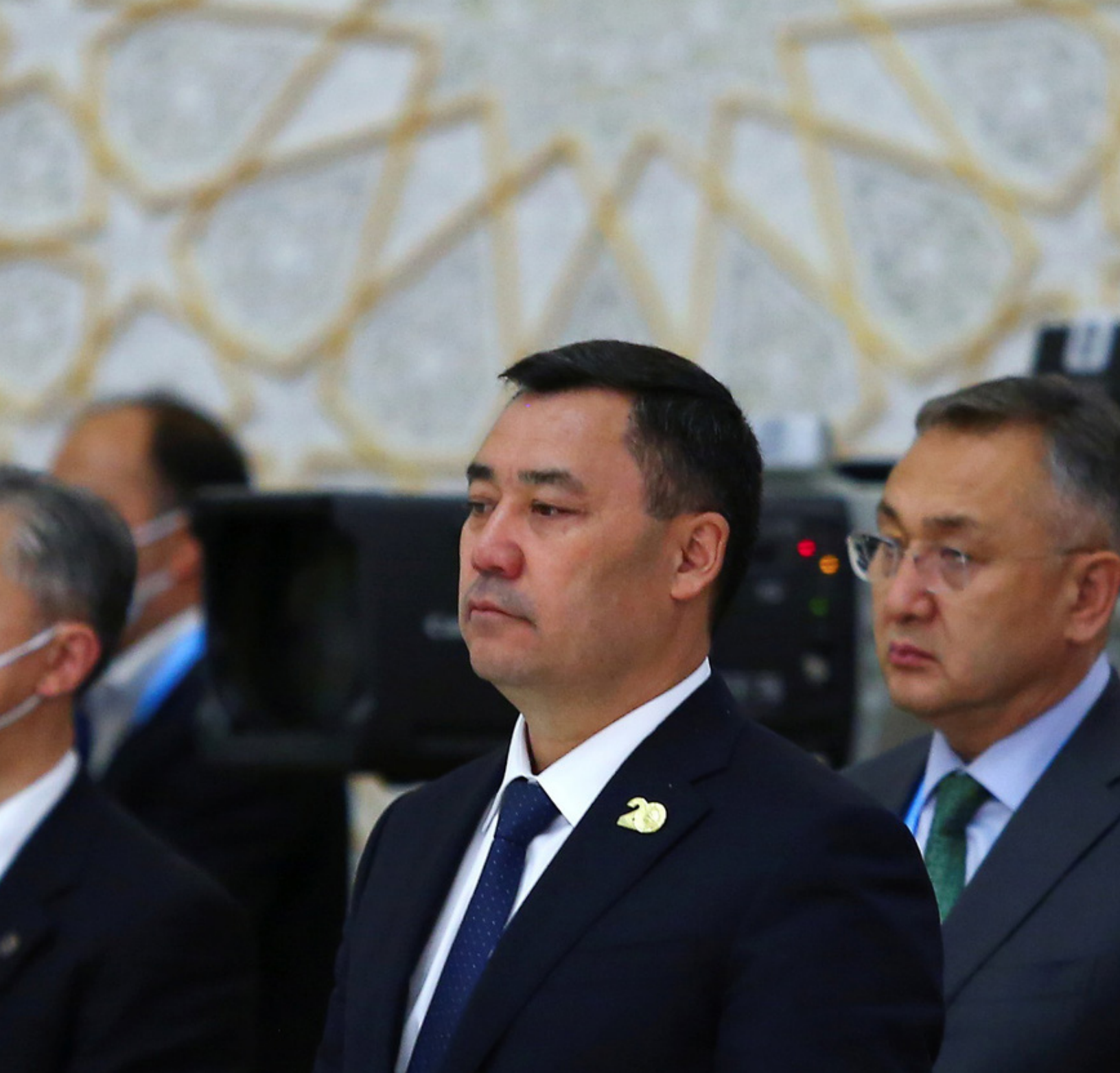
Kyrgyz President Sadyr Japarov attends the Shanghai Cooperation Organization (SCO) summit in Dushanbe, Tajikistan September 17, 2021.

This report identifies Beijing's goals and influence in the security and military sector in Central Asia. It supports a counterargument that the PRC is actively engaging and increasing its presence regionally beyond the economic sphere. It shows that security interests concerning Xinjiang have been the foundational drive from the Chinese