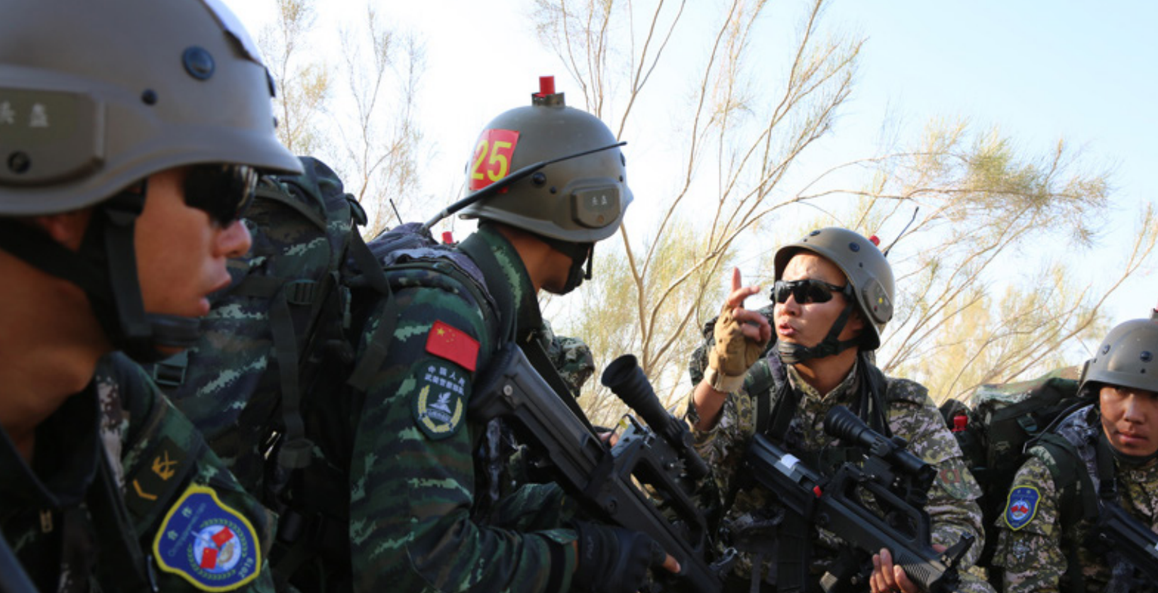
Military members from China and Kyrgyzstan participating in the 2019 Joint Anti-Terrorism exercise.

Chinese workers hostage. 78 For this exercise, the Chinese side deployed the PLA from Xinjiang.