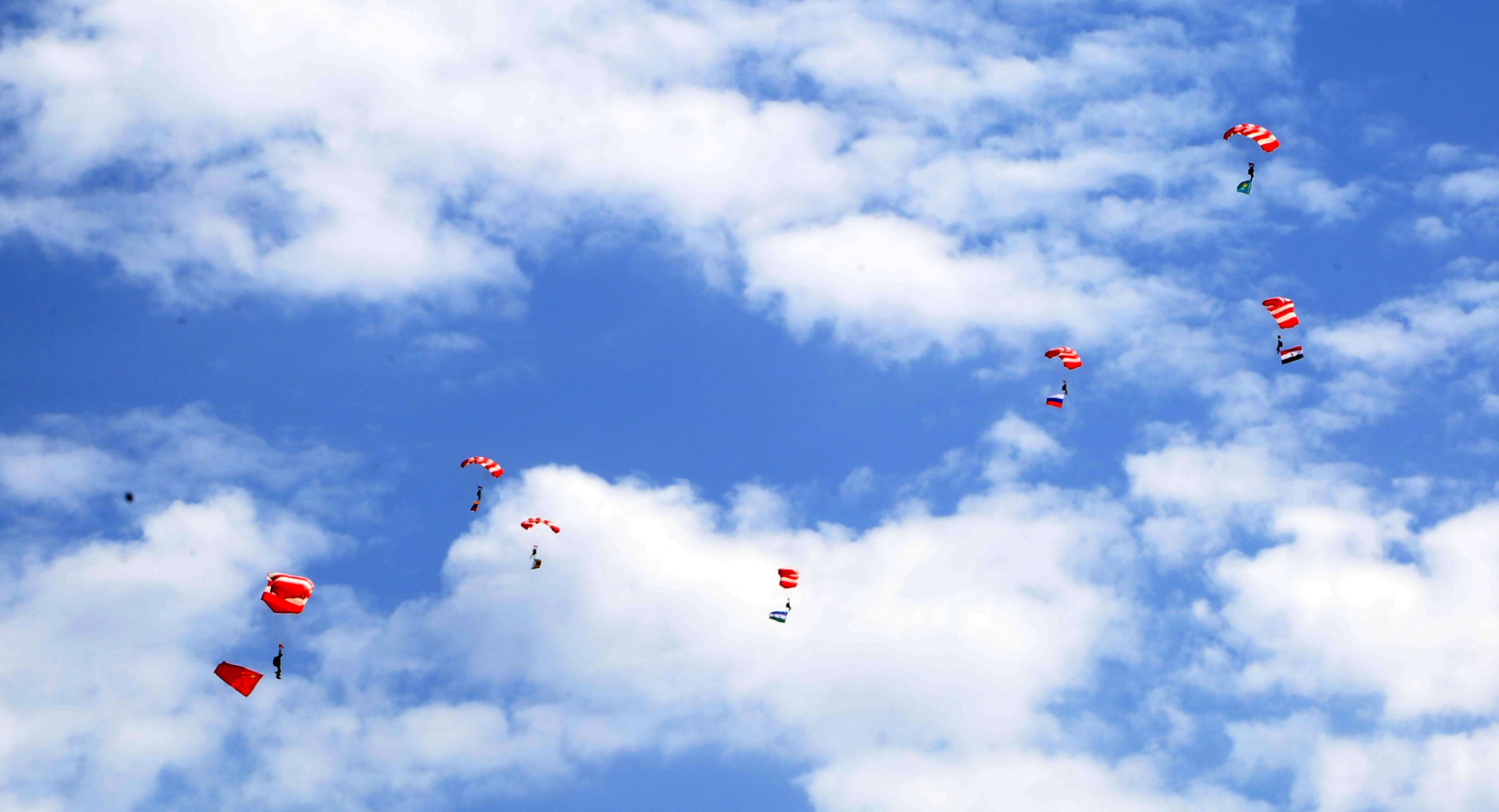
Paratroopers kicked off 2018 exercises in northwest China's Xinjiang Uygur Autonomous Region.