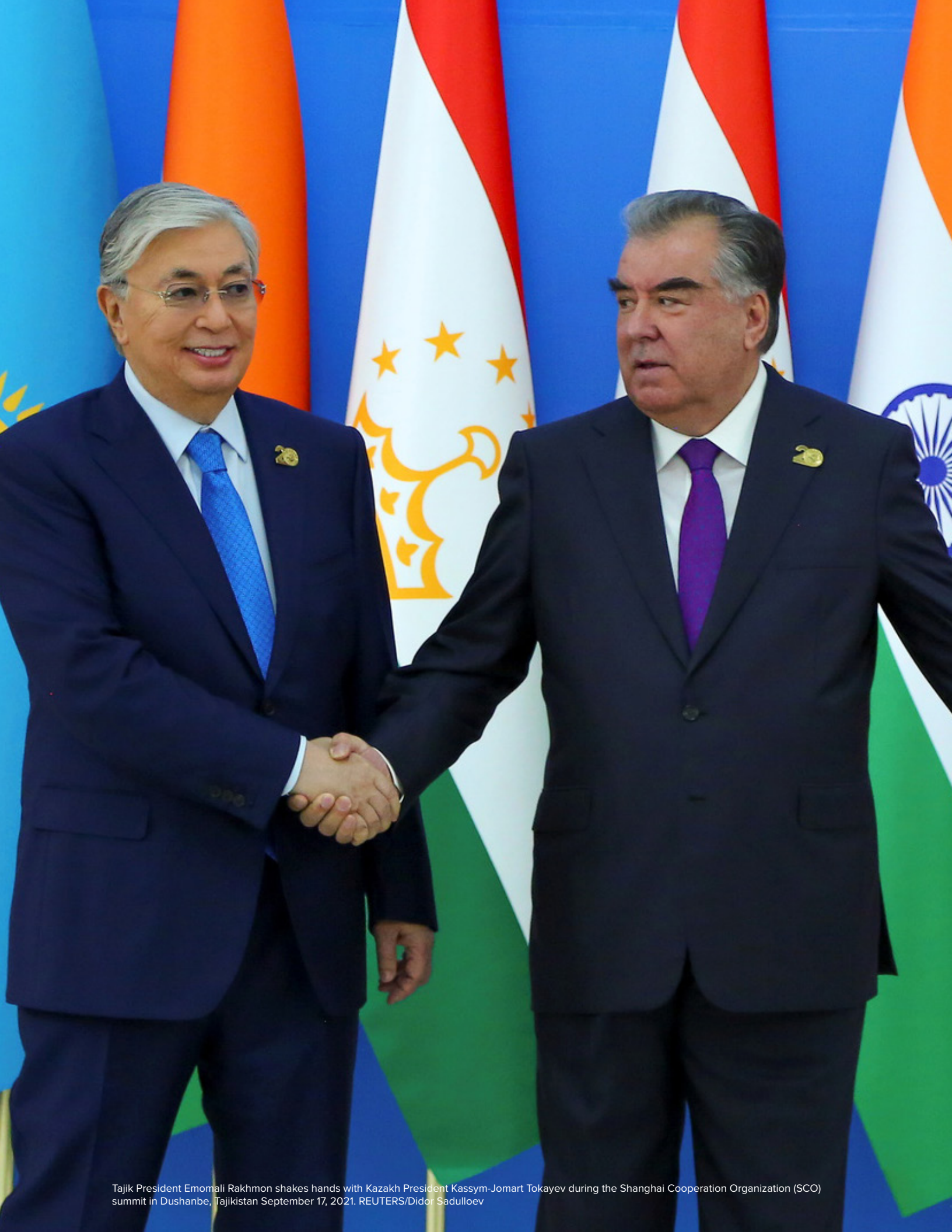
Tajik President Emomali Rakhmon shakes hands with Kazakh President Kassym-Jomart Tokayev during the Shanghai Cooperation Organization (SCO) summit in Dushanbe, Tajikistan September 17, 2021.