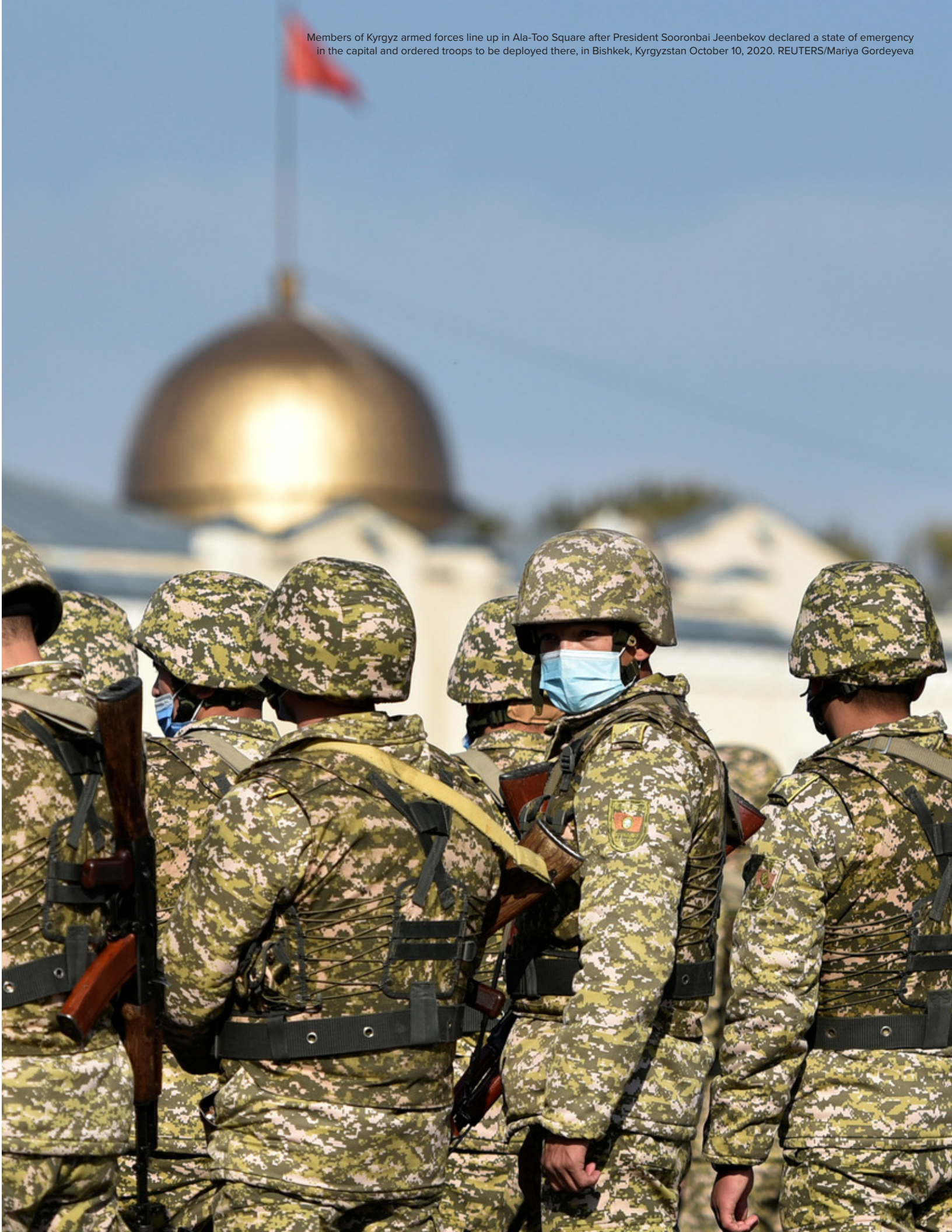
Members of Kyrgyz armed forces line up in Ala-Too Square after President Sooronbai Jeenbekov declared a state of emergency in the capital and ordered troops to be deployed there, in Bishkek, Kyrgyzstan October 10, 2020.