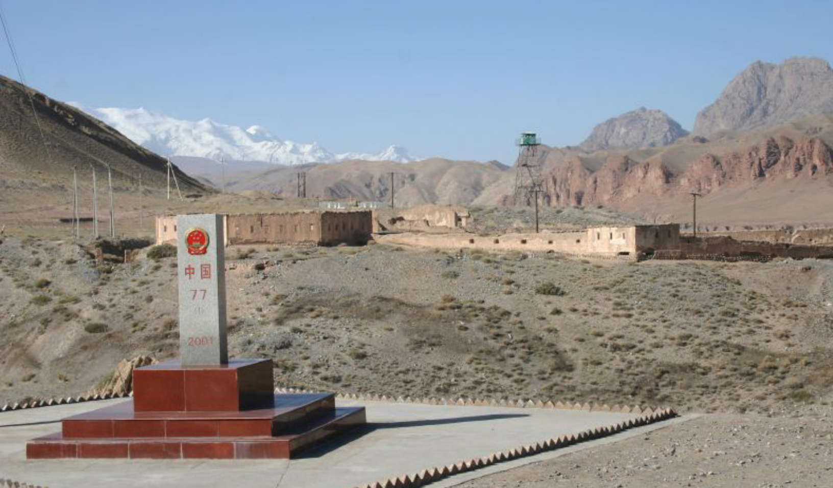
Chinese border post between Kyrgyzstan and China.

Between 1992 to early 2000s, there were many Uyghur associations set up by ethnic Uyghurs living in Central Asia. Some groups—such as the Committee for Eastern Turkistan and the United National Revolutionary Front of East Turkistan, both based in Kazakhstan; the Xinjiang Liberation Organization, based in Kyrgyzstan and Uzbekistan; and the Islamic Movement of Uzbekistan—were political groups distributing explicit messages demanding East Turkistan independence. 12 On the other hand, many were simply diaspora community groups hosting occasional cultural events and language classes; these groups also became targets of violence and intimidation from local law enforcement. 13