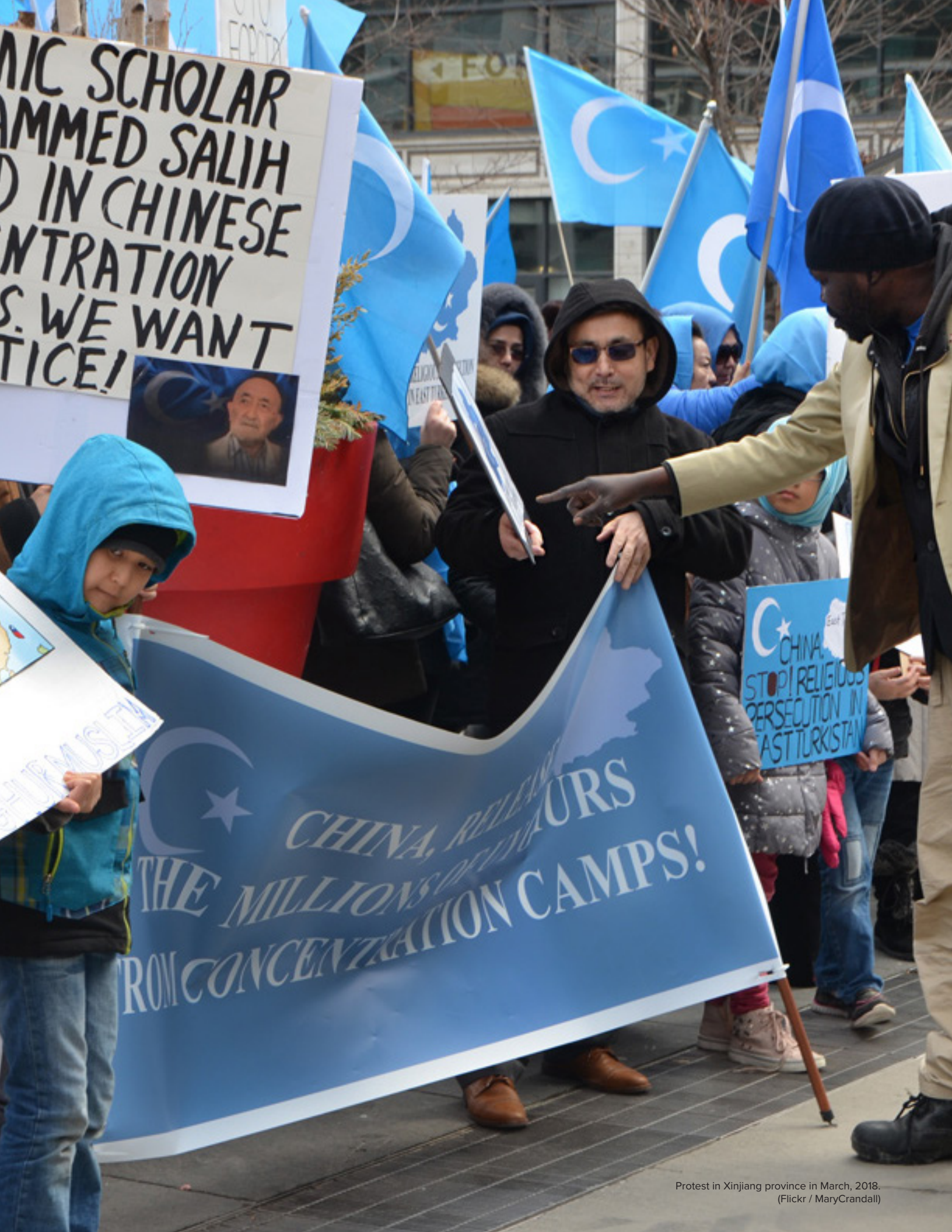
Protest in Xinjiang province in March, 2018.