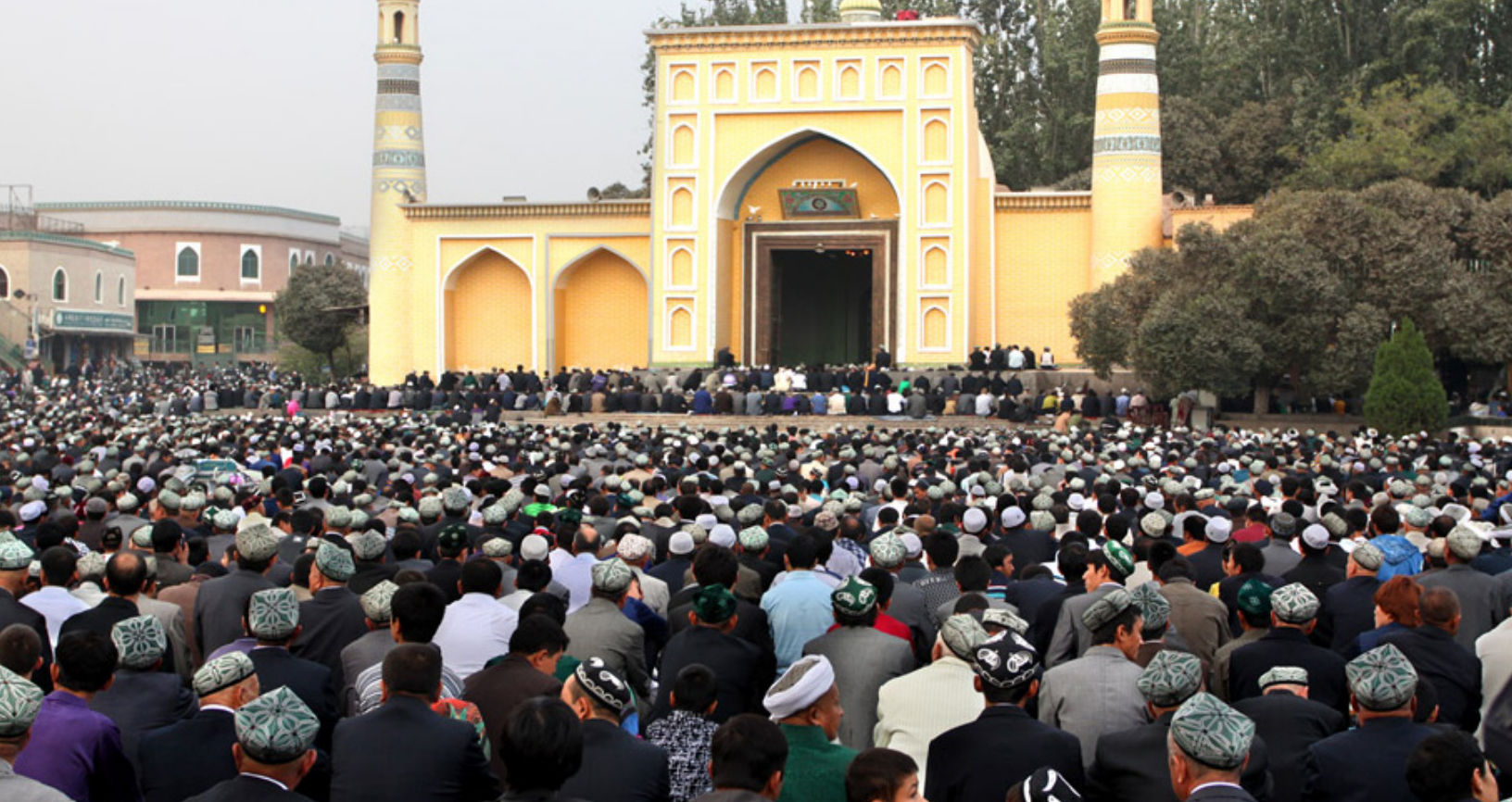
Id Kah Mosque in the city of Kashgar, Xinjiang.

of meetings with oil-and-gas-rich Kazakhstan, Uzbekistan, and Turkmenistan emphasized “protection of large cooperation projects,” 23 specifically to “protect the safety of natural gas pipelines,” 24 and later on explicitly stating that the two sides should establish a “pipeline security cooperation mechanism.” 25 After the Belt and Road Initiative launched in 2013, the discussion on investment protection was coined the “Belt and Road Initiative implementation security mechanism.” 26