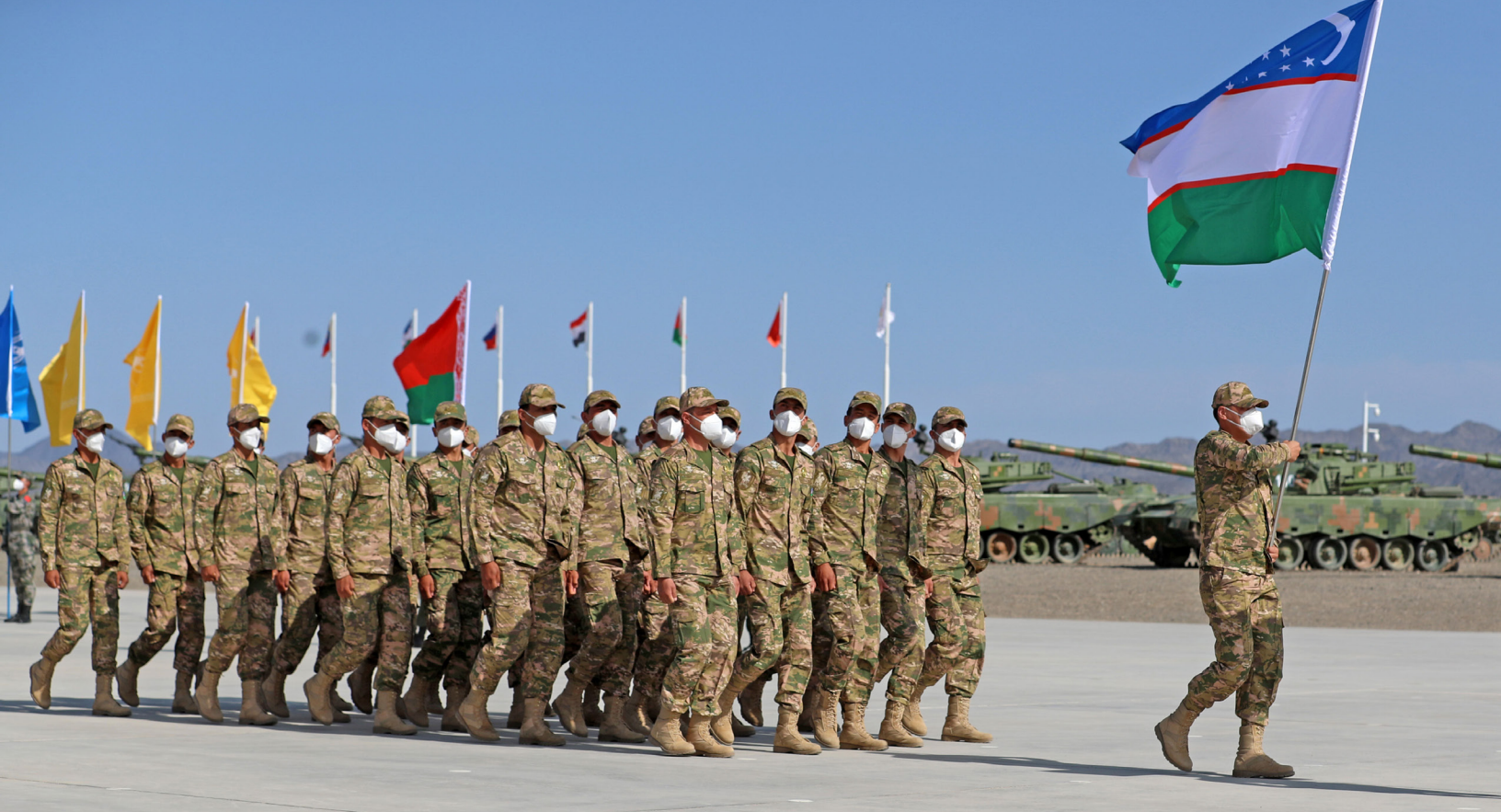
The opening ceremony of three competitions of the International Army Games, the Uzbek troops participating in the competition of the International Army Games in 2021.

security cooperation committee that meets with the PRC annually. 70 This is a dedicated occasion for security discussions between heads of departments and invited Chinese and Central Asian stakeholders. While this structure has become routine, a new “cross-departmental mechanism” 71 was introduced in 2019 between PRC-Kyrgyzstan and PRC-Kazakhstan. This mechanism was created to address specific security issues directly with security agencies in a cross-departmental and cross-regional manner. 72 This cross-departmental mechanism is